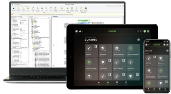
e.g. LOXONE Smart Home