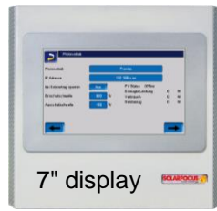
SOLARFOCUS eco manager-touch